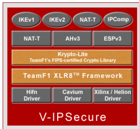
Fig 1: Secure Network Layer

the application, transport, network, or link layer. Placing security at the network layer has several advantages, especially when security requirements affect all data going through the stack. Network layer security is transparent to the applications which use the network stack. Further, the security architecture is independent of the network type or topology to which the embedded device is connected and encrypted packets can be routed and switched on any network that supports IP traffic. V-IPSecure implements a secure network layer (IPsec) that provides data integrity, origin authentication, data confidentiality, access control, partial sequence integrity, and traffic flow confidentiality services for communications between any two networks or hosts. Replay-detection as defined by the IPsec standard is also performed by using sequence numbers combined with authentication.